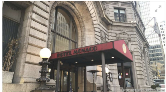
The Kimpton Hotel Monaco Inner Harbor in Baltimore